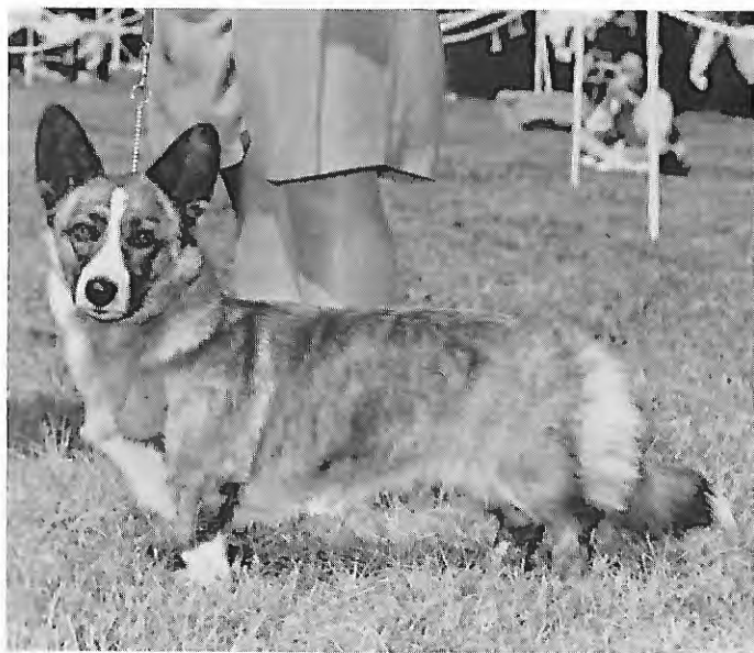
Spectrum Foxie Roxie

(Ch. Phi-Vestavia Nautilus x Ch. Davenitch Black Fox Barketta)