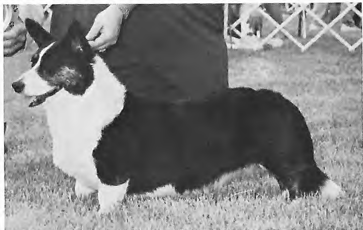
Ch. Kaschew Klassi Taima Bear

(Ch. Megwyn's Night Hawk x Bear Creek Blue Brandy)