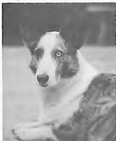
Davenitch Holde 501 Blus "Levi"